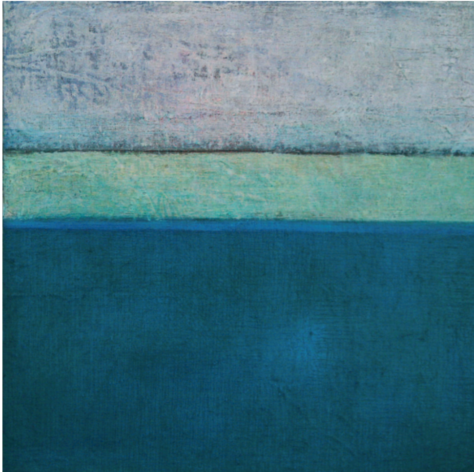
ABOVE Annemarie Murland Weaving Paint v Texture 2011 oil on belgian linen 60 x 60cm